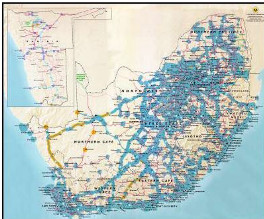
Figure 2: MTN Network Coverage (1999)

South Africa has seen phenomenal growth in the industry of around 50% per annum, and by the end of 1998 there were an estimated 2.1 million subscribers, providing industry revenues of roughly R4 billion per annum. This makes South Africa the largest GSM technology network outside of Europe and is the fourth fastest growing GSM market in the world. The Vodacom network has the larger share of the market with 55% of subscribers. National coverage of each network is very high with largely very small rural towns left unconnected. An example of coverage by one network, MTN, is provided in figure 2 below.